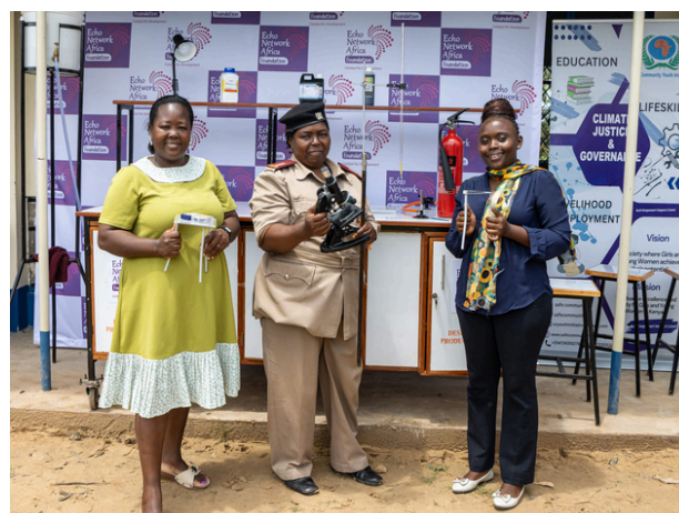
Leading by Example:

With Phase One now successfully established, the Echo Network Africa Foundation is leveraging the momentum and data gathered to prepare for a major expansion. The foundation is currently seeking partnerships to scale this success to an additional 98 schools nationwide. Leadership has emphasized that the completion of this first stage is only the beginning, as the Echo Network Africa Foundation remains dedicated to ensuring that every child in Kenya has the opportunity to explore science, innovate, and succeed in the global economy.