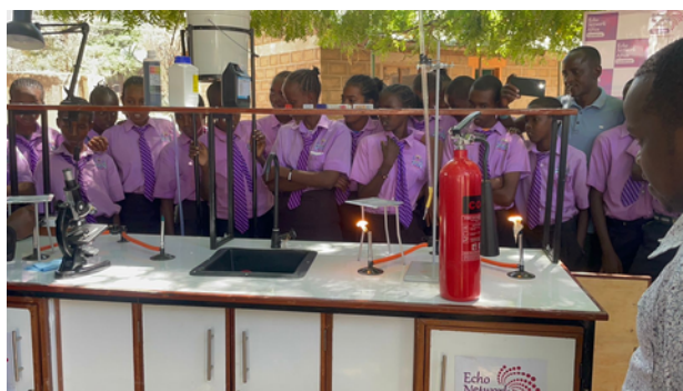
Students interact with the Mobile Labs in their Schools