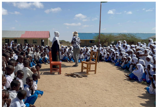
Mentorship Session at Dadachabasa Primary School (Isiolo County)