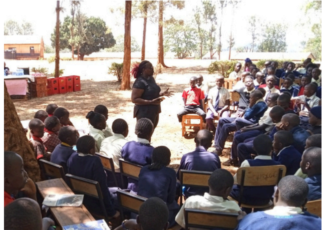
Mentorship Session at SabaSaba Primary School (Murang'a County)

Our facilitators led deep-dive sessions focused on building resilience against social barriers such as FGM and Gender-Based Violence while providing students with specific information on reporting mechanisms to ensure they have the agency to protect their right to stay in school. A core objective of the drive was narrowing the gender gap in technical fields by championing Hesabu Clubs and Mobile Labs as essential platforms for academic mastery. We are actively encouraging our girls to take up STEM pathways, positioning them to shape their own economic futures through science, hard work, and collaboration.