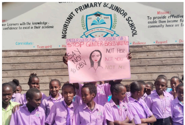
Mentorship Session at Ngurunit Primary School (Marsabit County)